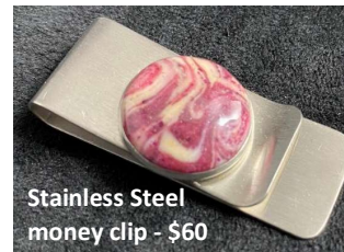
Stainless Steel money clip - $60