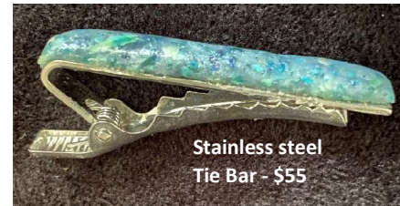
Stainless steel Tie Bar - $55