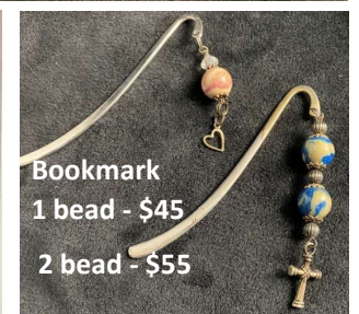
Bookmark 1 bead - $45 2 bead - $55