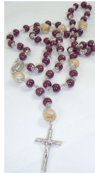
Rosaries – Oxidized Silver

Rosary - all flower petal beads with bead caps $245