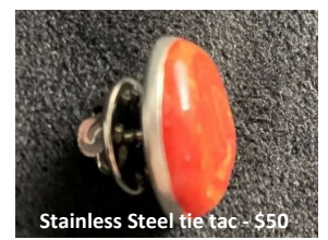
Stainless Steel tie tac - $50