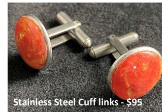
Stainless Steel Cuff links - $95