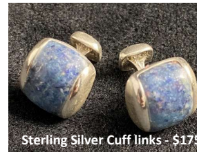
Sterling Silver Cuff links - $175