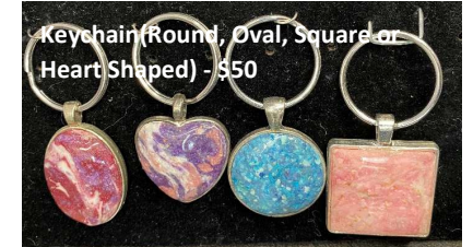
Keychain (Round, Oval, Square or Heart Shaped) - $50